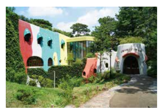
1. This hugely popular bus tour includes special entry to the advance-reservation-only Ghibli Museum. Spend 2.5 hours

2. In addition to the museum, visit Hotel Gajoen Tokyo (with lunch) and Edo Tokyo Architectual Museum which said to be the places where a movies was set.