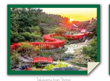
1 6-Day Northen Japan Tour

6-Day Northen Japan Tour (Round Trip from Tokyo) /TG0075/TG008S 1-Day Fukushima/TG004S 2-Day Omagari & Hachimantai / TG017S